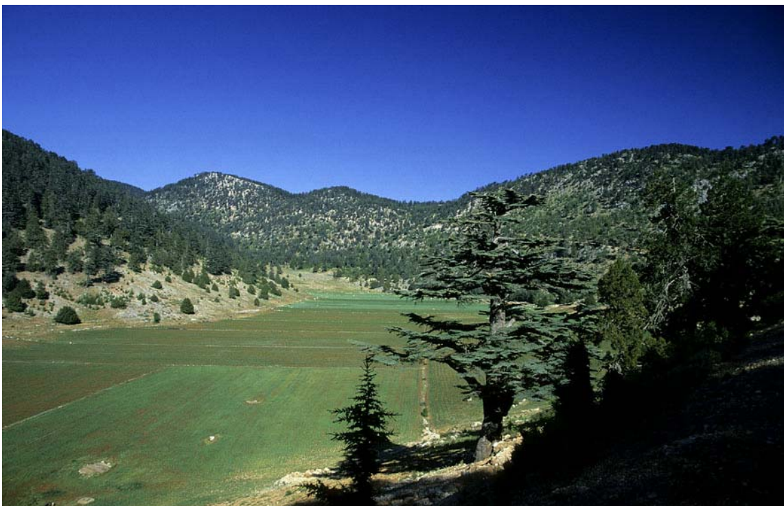
Left: plateau at the Karaovabeli pass (1490m). Barren farmland within the small plateau in the Olympos mountain. Note the configuration of the tree in the foreground which seems to be pruned. However, this is the result of nature and the rough seasons of this region. Canon EOS 30, 24-105mmL at 24mm, Velvia 50, polarization filter

The temperatures are rather hot in summer. Vegetation is almost burnt after July, so May and June are the most interesting months with regards to plants. Because of the drought in summer, a typical autumn corresponding to the Indian summer in northern latitudes is not seen. When travelling from April to May, the weathercasts are of great importance since unexpected showers and thunderstorms are possible in the mountains during that season. In summer, the temperatures are often too