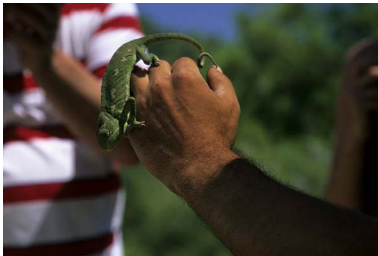
Left: Young chameleon on the arm of my guide through the hinterland of the eastern Taurus mountain. The reptile had tried to cross the country lane just in front of our jeep. It then crawled unimpressed on the arm and hand of the guide. We helped it to cross the lane and placed it within a pine tree. Canon EOS 30, Sigma 105mm Macro, Velvia 50

To over 98%, Turkey is an Islamic country. Most people in the southern and western parts, however, are very kind and helpful. There is no anti-western attitude among the people just as little as hostile behaviour. Friendly asking