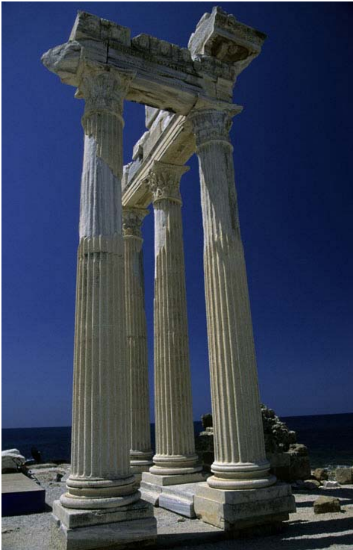
Left: the columns of the entrance of the ancient temple of Apollo, Side. Only this portal remained, the rest of the building is scattered in pieces over the area. Canon EOS 30, 24-105mmL at 24mm, Velvia 50, polarization filter

The vegetation is dominated by the pine forrests but nearly all plants growing in warm mountain landscapes can be found. The largest mammals are deer and wild boars. Further north with even less population, brown bears and wulfes are present, but it is difficult to find them. The wild boars, however, are a real problem for the farmer because the muslimic people are not allowed to eat them. Therefore, they are usually not hunted and their population has grown up.