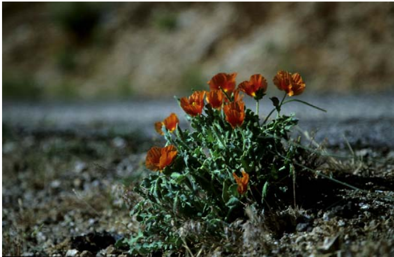
Left: wild poppy at flowering time in mid-june. Canon EOS 30, 24-105mmL at 70mm, Velvia 50

mountain path. The stones seem to burn and this light can be seen from the mediteranean sea by night. The phenomenon is caused by gas escaping from the rocks that catches fire due to the sun shining directly onto the stoness facing south. Ancient seamen thought that the fire, probably brighter two thousand years ago, was the breath of a mythical creature, the chimera.